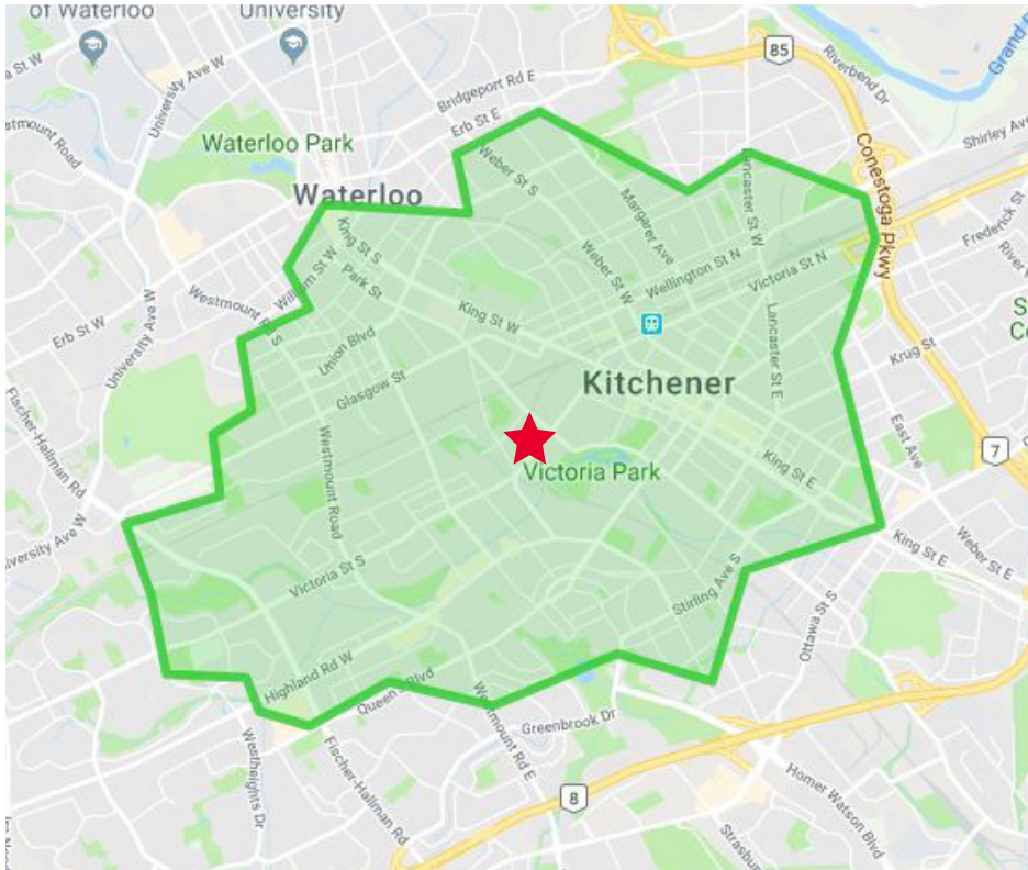
10-minute drive time