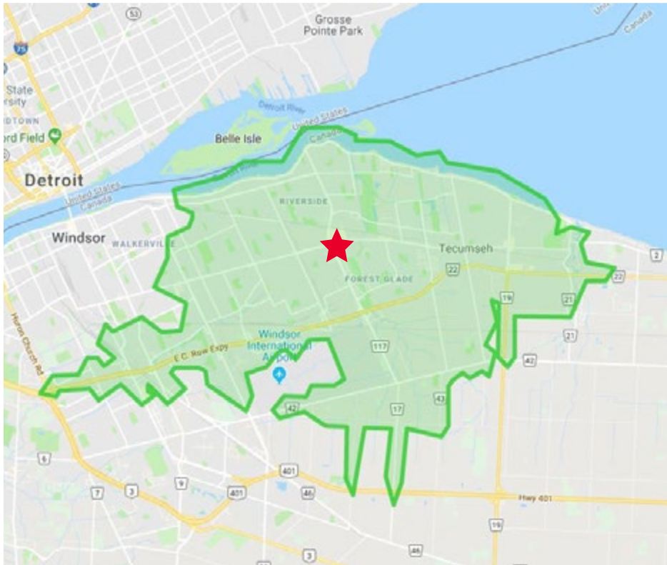
10-minute drive time